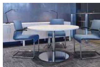
MEETING TABLE @ MIKE'S OFFICE