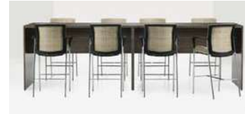
BAR HEIGHT TABLE