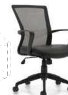
TRAINING ROOM CHAIR