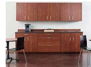
LOUNGE - BAR CABINETS