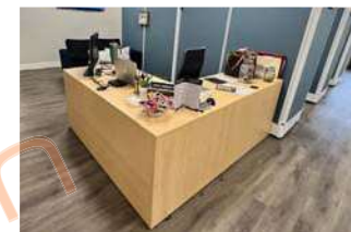
EXISTING FURNITURE [JILL'S DESK]