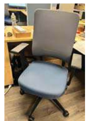
EXISTING TASK CHAIR