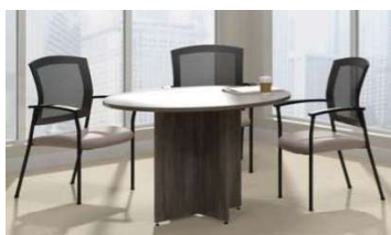
MEETING TABLE IN OFFICE #12